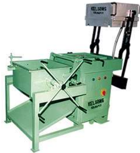
Shell molding machine